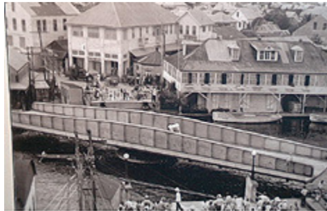
Belize City in 1923

The Heritage Awareness and Cultural Experience for Belizeans Organization (HACEB) was incorporated to shed awareness about the rich culture of Belize.